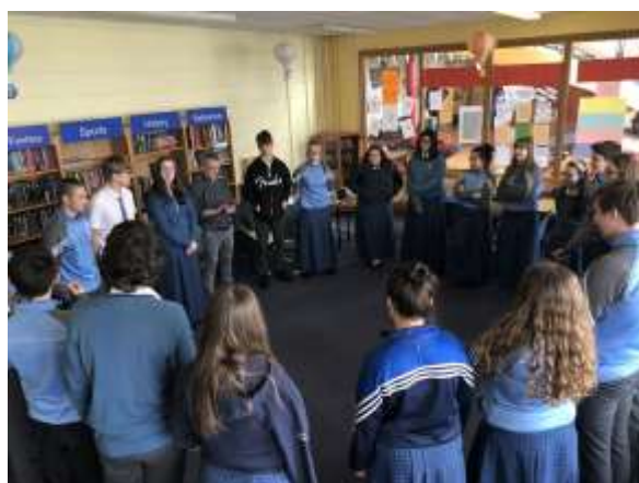
Transition Programmes 2019