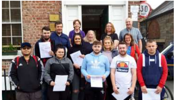
LCA Class 2019

LYS CTC is committed to developing Trainees' skills to succeed and bridge the gap to employment: 157 Work Experience Placements were facilitated in 2019 displaying LYS CTCs commitment to work/skills-based learning. Placements are of great value to Trainees in consolidating their learning, aiding self-guidance, development of 21st Century Skills, and preparation for employment or FET