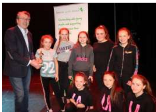
King's Island Youth Group 2019

The Kings Island Youth Project engaged 47 young people aged 10-16 years from across the Kings Island area of Limerick City. Nicholas Street Youth Space provides services and supports to young people including: