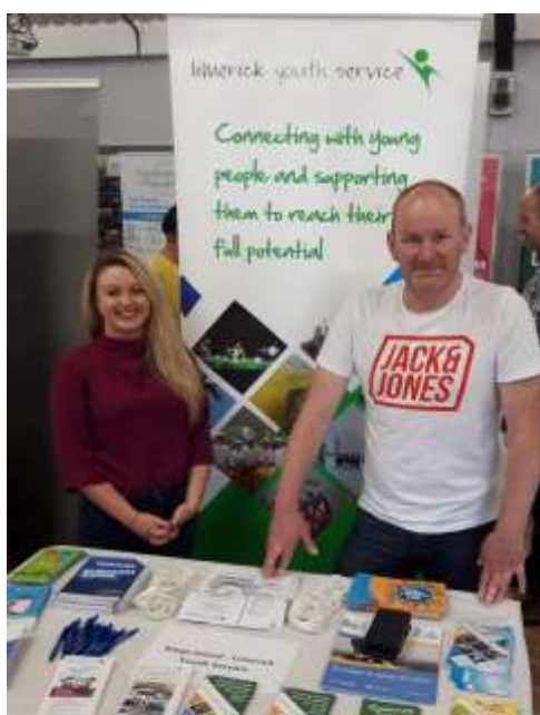
2019 saw the opening of newly refurbished youth friendly Nicholas St. Youth Space, Nicholas Street