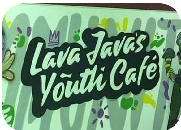
Members of Lava Java's Youth Committee

Lava Java's Youth Cafe is a youth led project in the centre of Limerick City providing a fun, friendly, active and engaging environment for Limerick's vibrant and diverse young people.