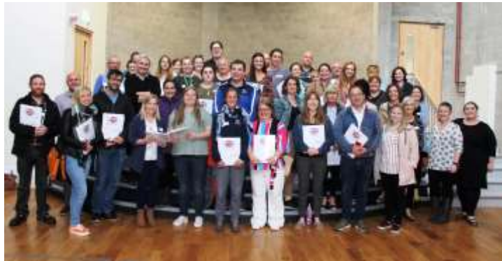
Youth Participation Training with Hub na nÓg (DCYA)

A competency Based Performance Achievement system was also implemented in 2019.