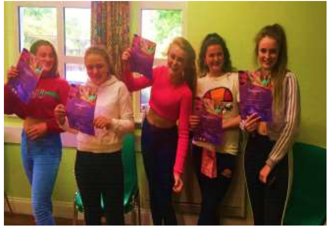
Askeaton Girls Group receiving their certificates on completing a nail art course