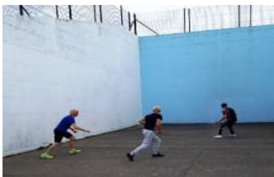
Handball in Kings Island