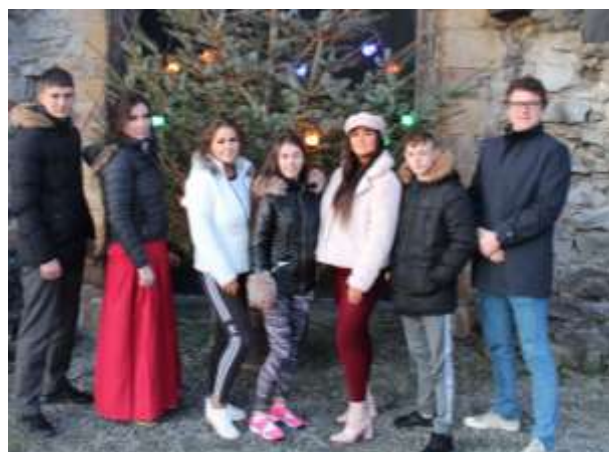
Graduates from LYS' Youth Employability Initiative Programme at Nicholas St Youth Space

On completion of the work to learn programme, participants have gained knowledge and skills in CV development, job research and application skills, interview and work experience skills. The participants completed work experience placements in areas including catering, sport and working with animals.