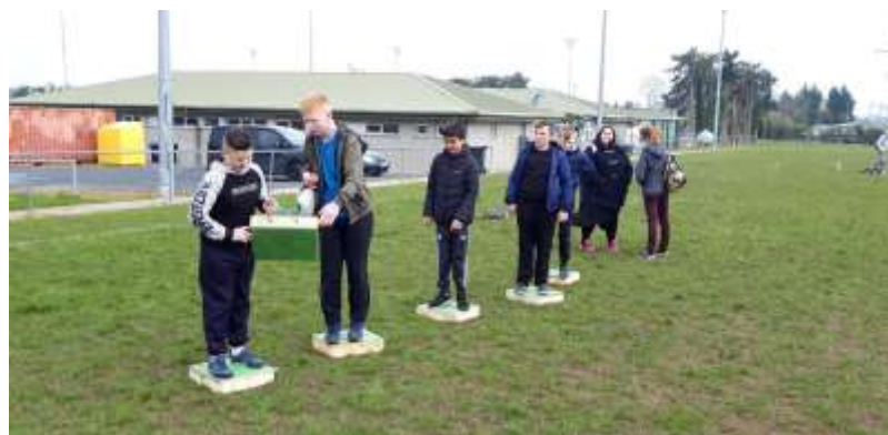
Youth Games 2019

Over 1,700 young people attended youth club discos in Foynes, Newcastle West, Askeaton and the Southside Factory Disco. Almost 300 young people attended large-scale events including the LYS End of Year Games and the Youth Factor.