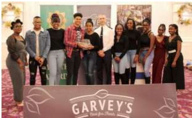
Garda Youth Awards 2019