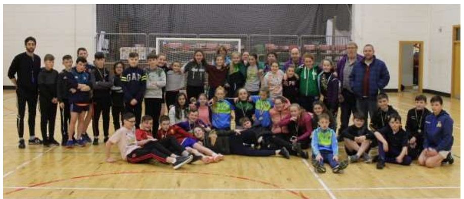
Clonlara & Kildimo Youth Clubs