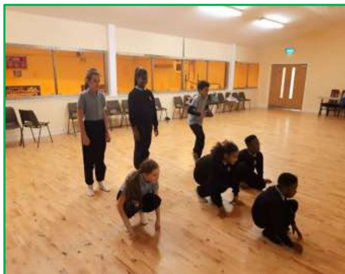
Let's dance! Caherconlish crew getting in some practice ahead of the 2019 Youth Factor!