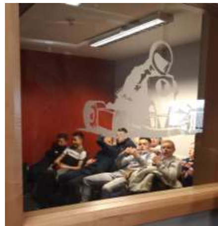
In 2019 the Senior Traveller Boys Group met every Wednesday to socialise, take part in a health and fitness programme and a baking programme.

The boys developed life skills and had an opportunity to have fun in a safe environment.