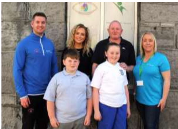
Garryowen Youth Project

The Detached Youth Work Programme is an outreach programme that engages with vulnerable and socially excluded young people and helps them connect with supports that will aid them in addressing their needs.