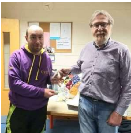
Volunteers – Clonlara Youth Club

In 2019, a total of 56 young people across Limerick City and County completed the original Youth Scotland 'Involvement Training Programme'. An evaluation of this programme was conducted with 6 participants to inform the development of the new LYS Leadership Programme, in addition to feedback from experienced LYS staff.