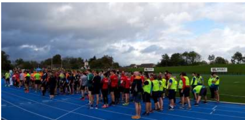
Company Marathon Challenge 2019 – University Of Limerick

https://limerickyouthservice.com/resources-publications/#baseline-study-needs-analysis-of-young-people-in-rural-county-limerick-10-18yrs