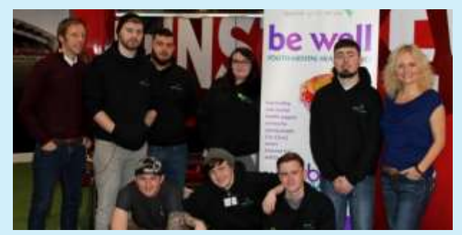
During 2018 the YAP

This project led to the establishment of a BE Well' Youth Advisory Panel (YAP) which includes 8 young people aged 18-22. The aim of Be Well's YAP is to strengthen the voice and influence of young people in youth mental health services, Regarded as essential in achieving progressive service development, which is responsive to the needs of young people (Irish College of Psychiatry, 2013).