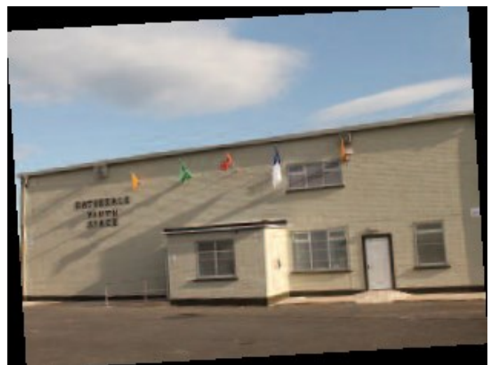
Rathkeale Youth Space