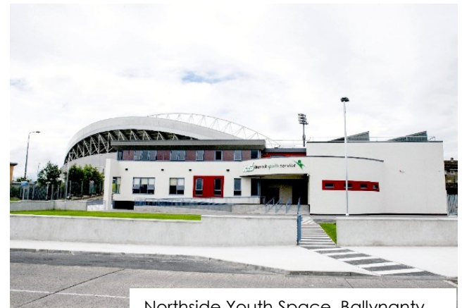
Northside Youth Space, Ballynanty

Working in partnership with local communities, LYS also facilitates youth clubs and programmes in community venues and facilities across Limerick City and County including provision in more isolated rural communities