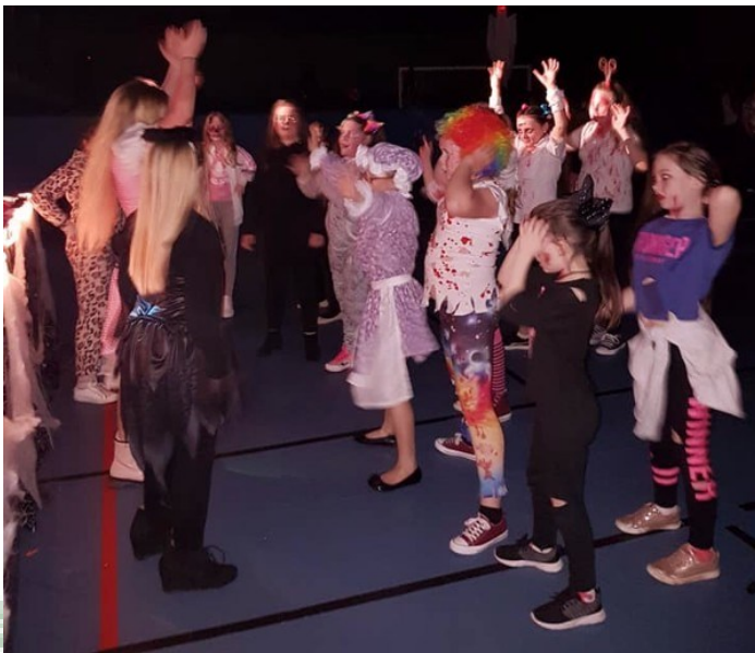
Halloween Disco 2017