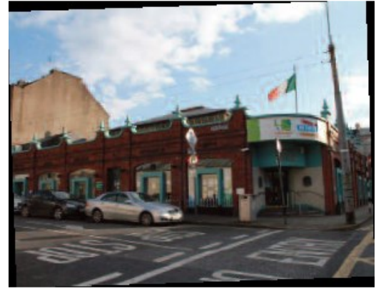
LYS Community Training Centre, Lwr Glentworth St. Limerick