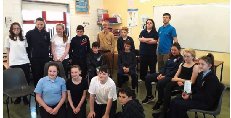
Above: Delivering our Transition Prog with First Years at Coláiste Mhuire, Askeaton