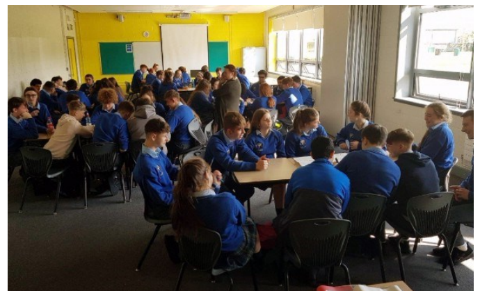
Mentoring Programme Coláiste Íde agus Josef, Abbeyfeale