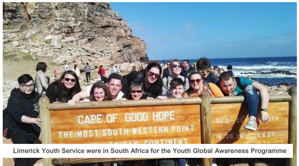
Limerick Youth Service were in South Africa for the Youth Global Awareness Programme

Limerick Be Heard is a joint initiative with LYS, Limerick Comhairle na nÓg and the Department of Politics & Public Administration at the University of Limerick, Limerick Be Heard aims to increase the political participation and civic engagement of groups whose voices are seldom heard in mainstream electoral discussions, such as young people. In 2017 young people from LYS travelled to South Africa as part of the project