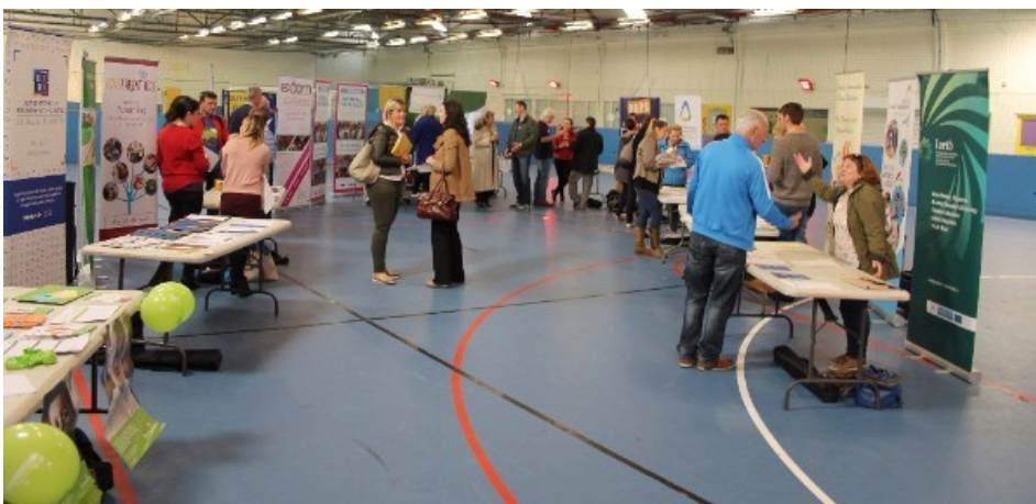
Southside Youth Forum 2017