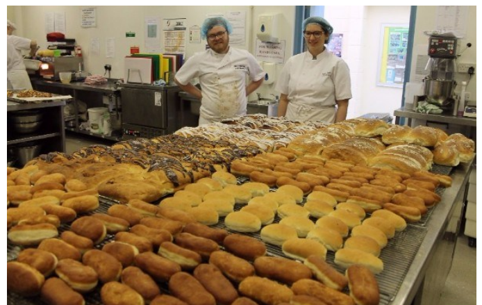
Participants on Bakery Project 2017.

162 young people between the ages of 15 and 21 were registered with the Community Training Centre in 2017.