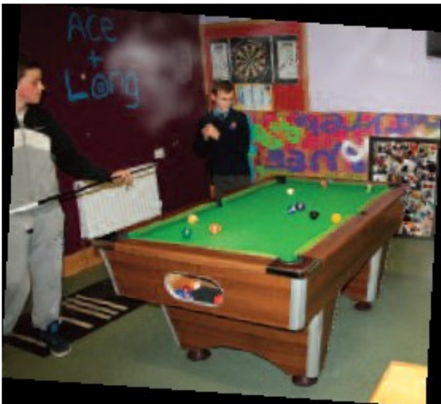
Kings Island Youth Space, Nicholas St, Limerick

Working in partnership with local communities, LYS also facilitates youth clubs and programmes in community venues and facilities across Limerick City and County including provision in more isolated rural communities