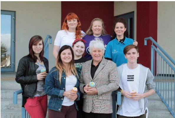
Minister for Health Promotion, Catherine Byrne TD at the launch of the youth part of Limerick Mental Health Week at the Northside Youth Space.

Limerick Youth Service, Youth Mental Health Project aims to address youth mental health needs through the provision of: